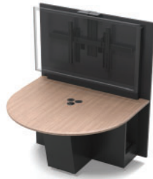
Code T526HR-S 526HR + 526RW-S (Single Monitor Mount)